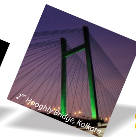
2 nd Hooghly Bridge, Kolkata