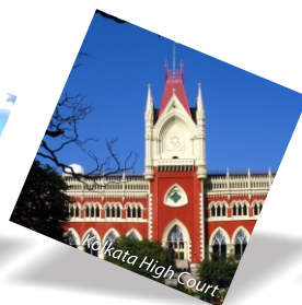
Kolkata High Court