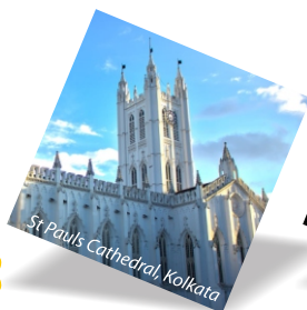
St Paul's Cathedral, Kolkata

However, it is the Durga Puja in autumn each year during which Kolkata is at its best and the most resplendent. Irrespective of where you are from, you will feel at home in this city - in Kolkata.