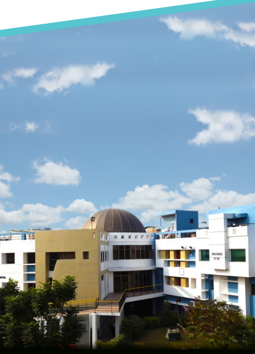
Children's Unit, SGCCRI

Saroj Gupta Cancer Centre & Research Institute, Thakurpukur, Kolkata