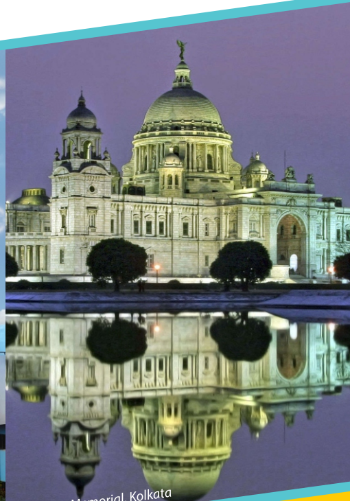
Victoria Memorial, Kolkata