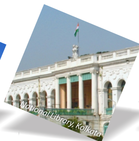
National Library, Kolkata