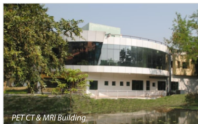
PET CT & MRI Building