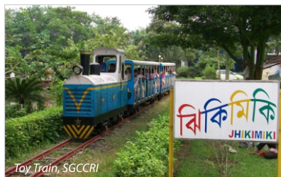
Toy Train, SGCCRI